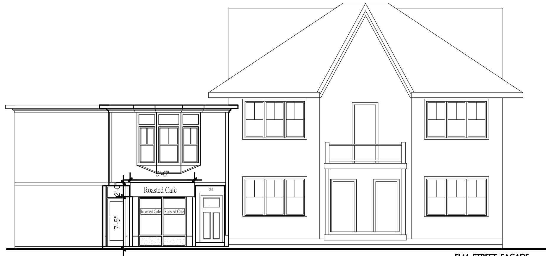
ELM STREET FACADE