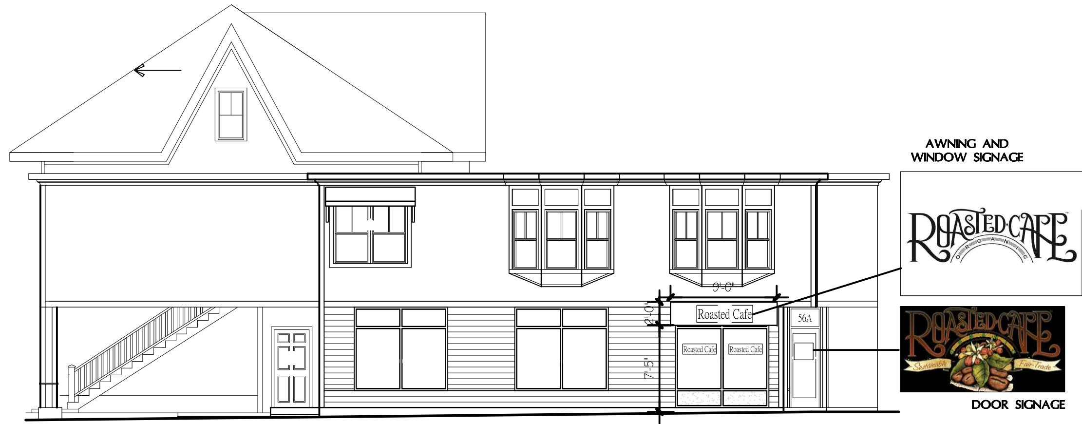
MOSSLAND ROAD FACADE

CSS ARCHITECTS INC 107 Audubon Road Building Two, Suite 300 Waverfield, MA 01980 css@cassarchitects.com